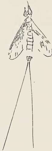
Text figure 1. Diaphanoptera scudderii (Brongniart), after Brongniart, 1893.

Fore and hind wings similar; Sc terminating on R1 slightly beyond mid-wing; MA diverging away from MP immediately after its origin and just touching or very nearly touching Rs before continuing as an independent, convex vein; CuA coalesced with the base of M. Several large, thickened, circular spots on membrane of both wings. Body